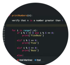
Tech Interview Prep