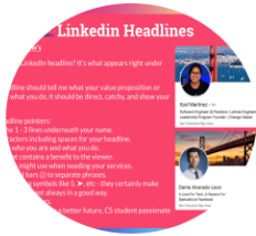
Soft Skills Workshops