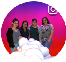
Tech Company Tours