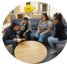
Community of Support